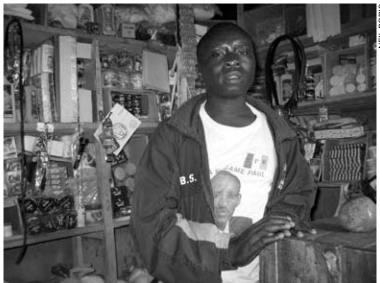
A 21-year-old head of household in Rwanda in the store he rents to provide income for his three siblings.

To respond to this gap, Tulane University School of Public Health, Rwanda School of Public Health, World Vision Rwanda (WVR), and the Horizons Program formed a partnership to assess the impact of participation in an adult mentorship program on the psychosocial well-being of youth living in Gikongoro province of Rwanda and of the adult mentors. In addition, the study aims to develop, pilot, and refine a reliable and valid instrument to assess community-based psychosocial interventions. This report presents key findings from the baseline data collected as part of this collaborative project.